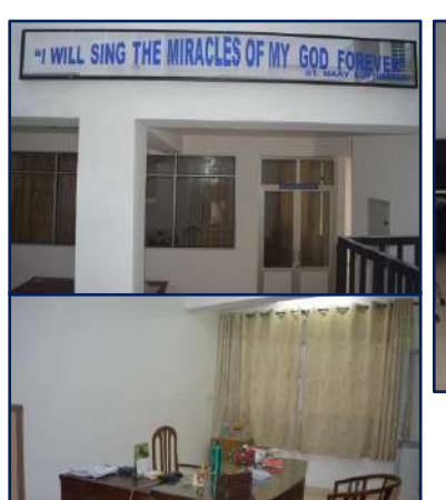
Vice Principal's office