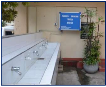
Purified Water System