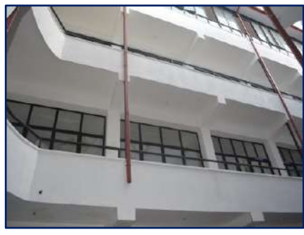
Five storied building – Upper School