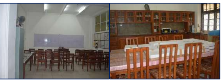
Home Science Room

Converted old Home Science Room to new sports and multi-purpose rooms to give a better service to the children and parents