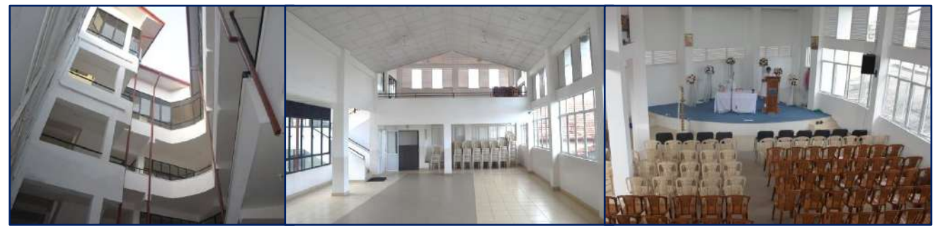
A hall with 600 seating capacity